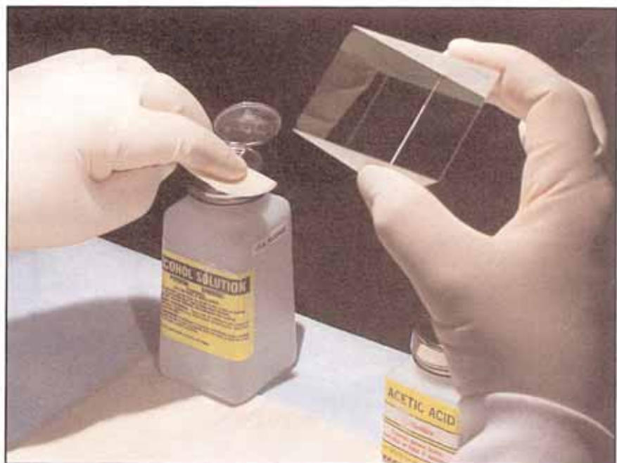
Precision optics should be handled properly in cleaning. Here, the prism is held on the frosted surfaces.