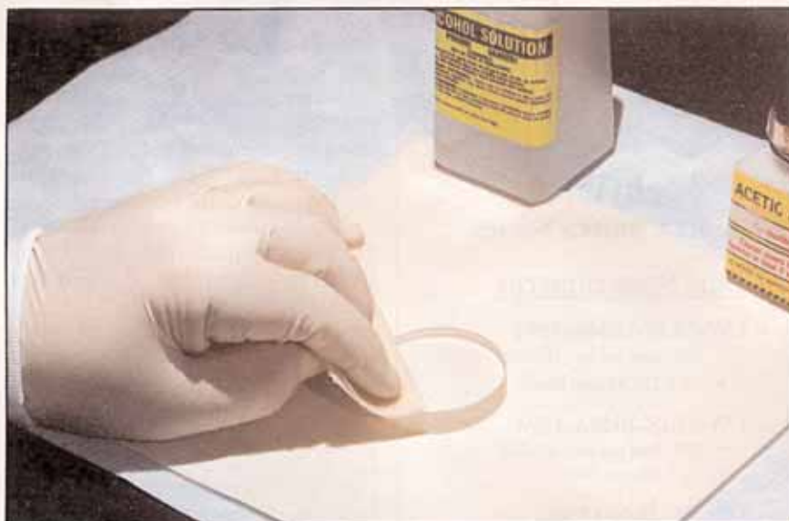
The wipe technique should involve smooth and continuous motions of the lens tissue across the optic.

The wipe method is recommended to remove fingerprints and other embedded residues on uncoated surfaces or durable coatings. This technique uses a clean lens tissue or wipe folded into a brush and grasped near the fold with a hemostat, fingers or tweezers. Several drops of solvent are placed on the fold, and the excess is shaken off. With gentle, uniform pressure, the brush is wiped slowly from one edge of the optic to the other