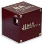
Beam Analyzer Camera (BA)