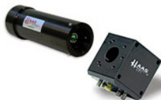
Laser Diagnostic Accessories

The BWA-MON is a modular focus head design configured for the Beam Analyzer (BA-CAM) and the Beam Waist Analyzer (BWA-CAM) for most applications and laser wavelengths. The design contains no “moving components” and provides instantaneous measurement and analysis of the laser beam and its optical elements.