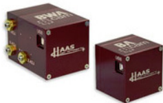
BA CAM & BWA CAM Dual System

The Beam Waist Analyzer (BWA-CAM) provides “Real-Time” near-field M2 measurements with no moving components. The (BWA-CAM) provides instantaneous analysis and monitoring of the laser beam and all active optical elements.