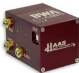
Beam Waist Analyzer Camera (BWA)

The Beam Analyzer (BA-CAM) provides “Real-Time” far-field viewing, measurement, analysis and monitoring of laser spatial distribution, laser power, beam diameter, beam ovality, beam center and beam centroid. The BA-CAM can also monitor the laser beam for degradation, stability, power, alignment and tuning.