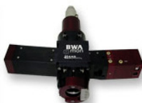
Beam Waist Analyzer Monitor (BWA-MON)

The dual systems incorporates both the Beam Analyzer (BA-CAM) and the Beam Waist Analyzer (BWA-CAM) to provide “Real-Time” near-field and far-field viewing, measurements and analysis of the laser beam.